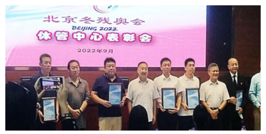
The Group's representatives attended the recognition ceremony for the Beijing 2022 Winter Olympic and Winter Paralympic Games

On September 9, 2022, the "Beijing Winter Paralympic Games Commendation Ceremony" was held in the auditorium of the China Disabled Persons Sports Management Center. Ltd. A subsidiary of the Group, received the commendation as the heating operation support unit. The ceremony highly praised the Group's subsidiary for providing safe operation of heating for a series of venues during the world-famous Beijing 2022 Winter Olympic Games and Winter Paralympic Games, and commended the on-site staff sent by the Group.